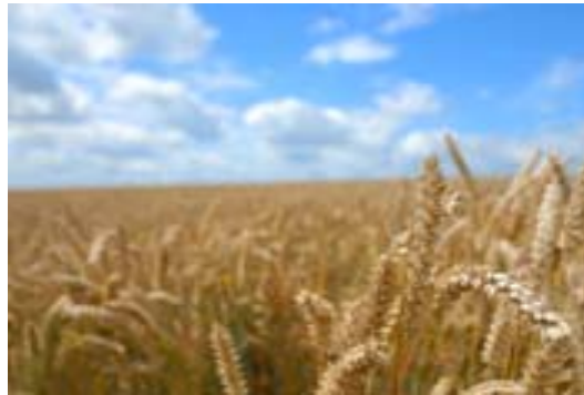
Len Bykowski -Oct 2008 "Till Baby Till"